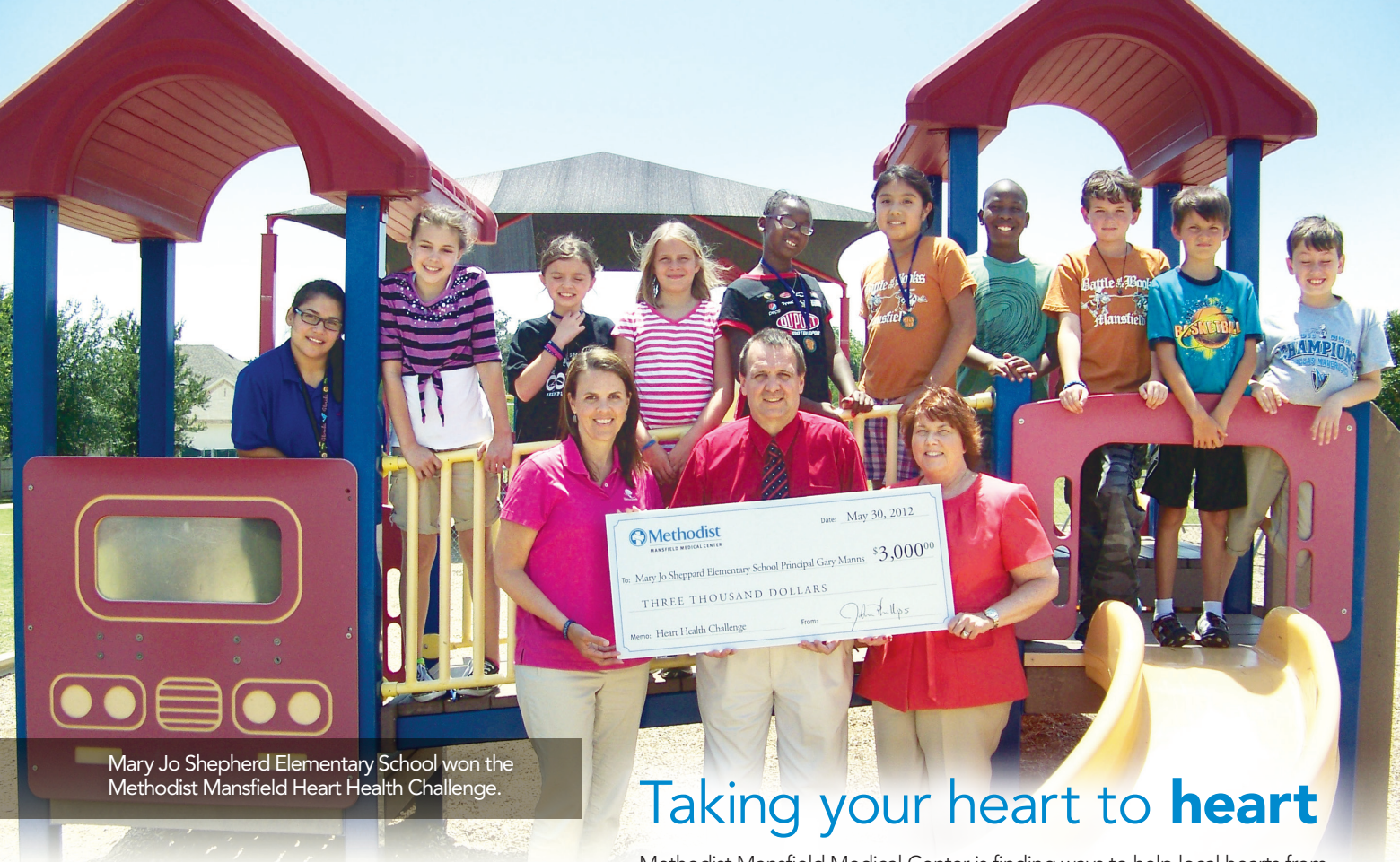
Mary Jo Shepherd Elementary School won the Methodist Mansfield Heart Health Challenge.