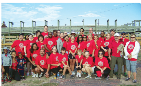
Employees helped raise more than $7,000 for the Tarrant County American Heart Association Heart Walk.

Texas law prohibits hospitals from practicing medicine. The physicians on the Methodist Health System medical staff are independent practitioners who are not employees or agents of Methodist Health System or Methodist Mansfield Medical Center.