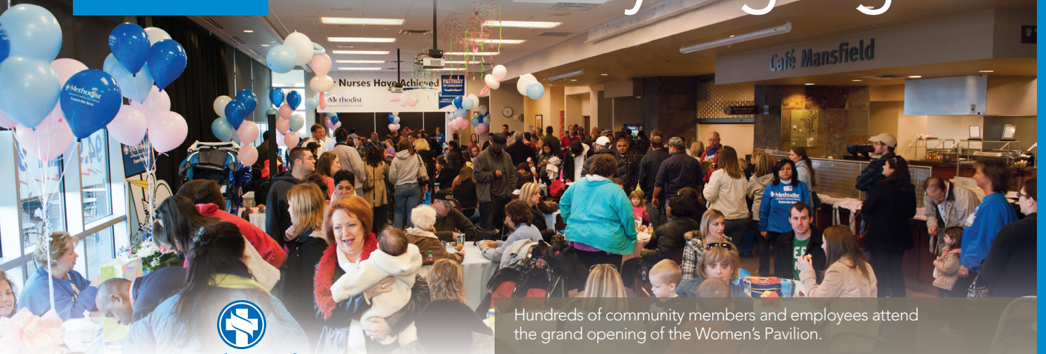
Hundreds of community members and employees attend the grand opening of the Women's Pavilion.